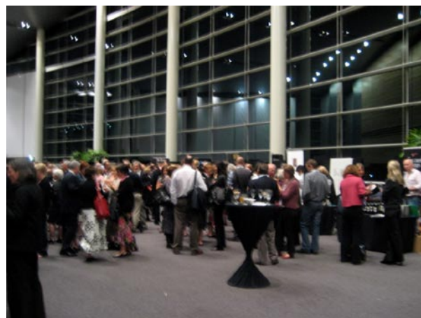
ASCIA 2009 Welcome Function Adelaide Convention Centre 15 September 2009