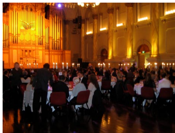
ASCIA 2009 Gala Dinner Adelaide Town Hall, 16 September 2009